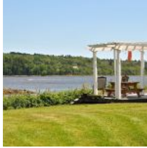
Featherbed Island House

Quite possibly the most perfect rental on VRBO. The pantry contained LITERALLY every imaginable appliance. Gorgeous, relaxing surroundings. Definitely for groups who can make their own fun & enjoy each other's company as there's not a ton to do in Machias / Machiasport but once we checked into the house nobody wanted to leave anyway!