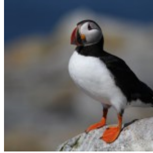
Featherbed Island House

A wonderful location to just relax and unwind and a great base to explore the Bold Coast from Eastport to Lubec to Campobello Island and the hiking trails throughout the region. The cottage was fantastic, the location is beautiful and everything was perfect.