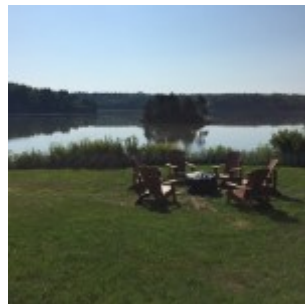
Featherbed Island House