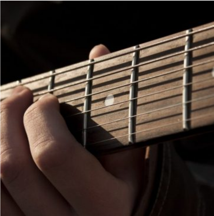
The Stillwater's Band and Benefit