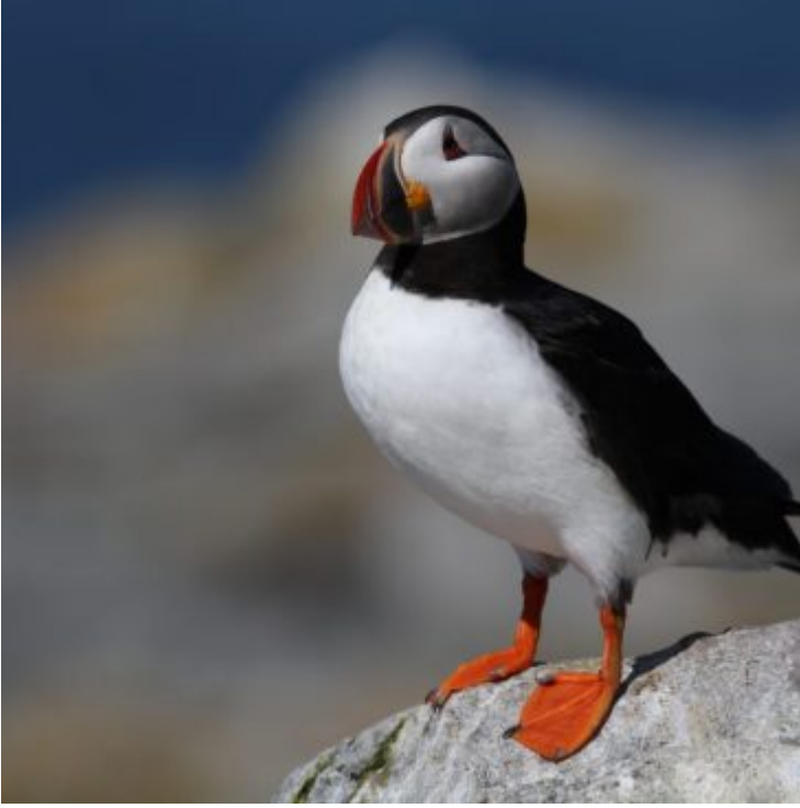
Bold Coast Charter Company - Cutler, Maine