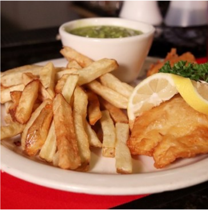
Local Community Fish Fry - Machias