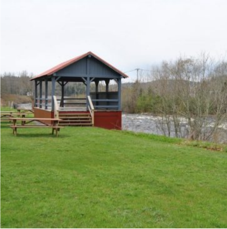
Mill Memorial Park - East Machias