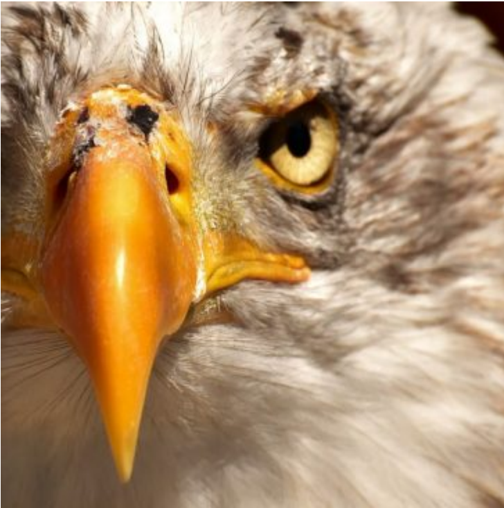
Songbird & Warbler Birding Field Trips sponsored by Schoodic Institute