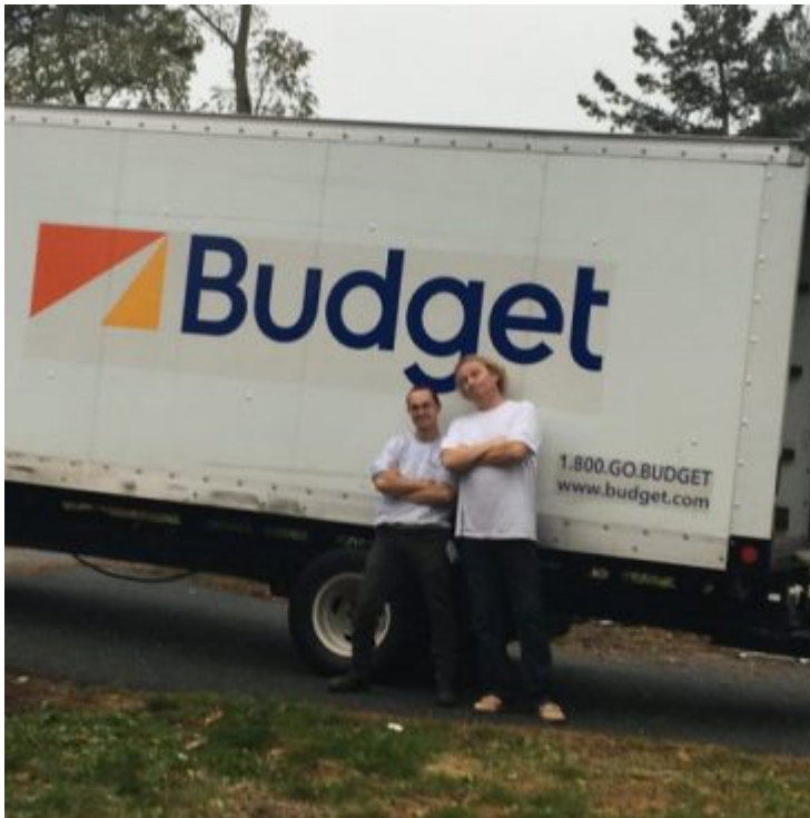
Big Changes For Us...