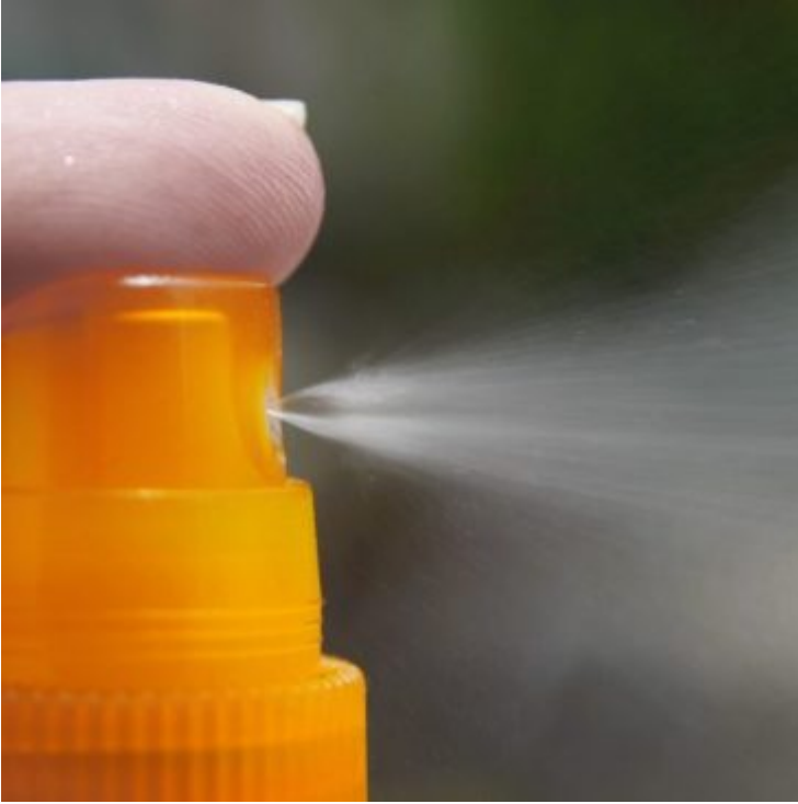
All natural bug repellent for Maine summers