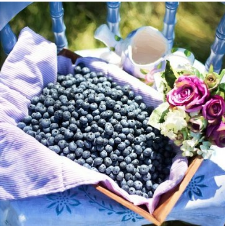
Machias Blueberry Festival