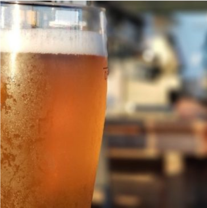
A great brewery in Bar Harbor - Atlantic Brewing Company