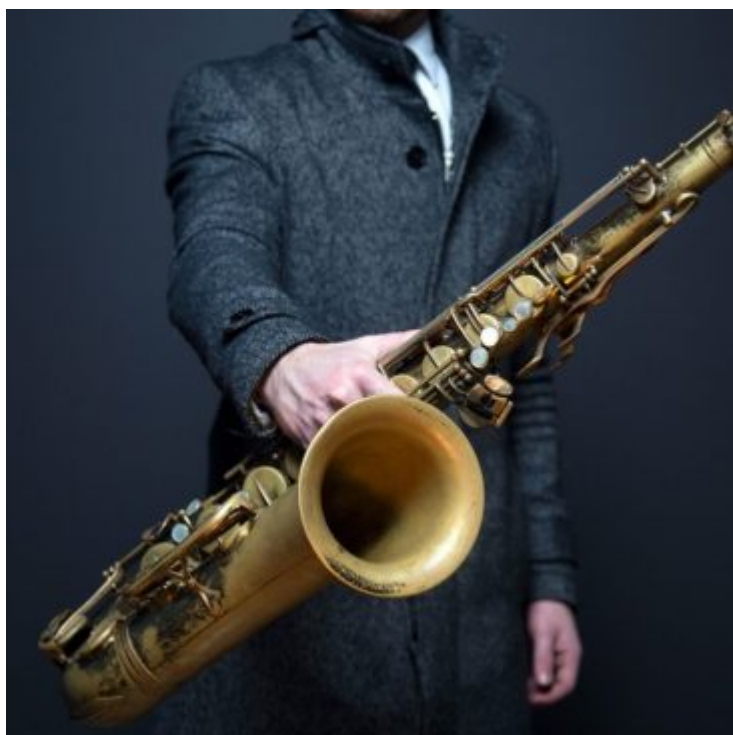
The Jazz Collective