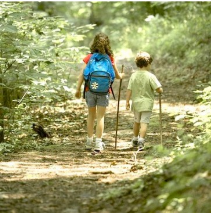
Free Admission to Acadia National Park Days - 2018