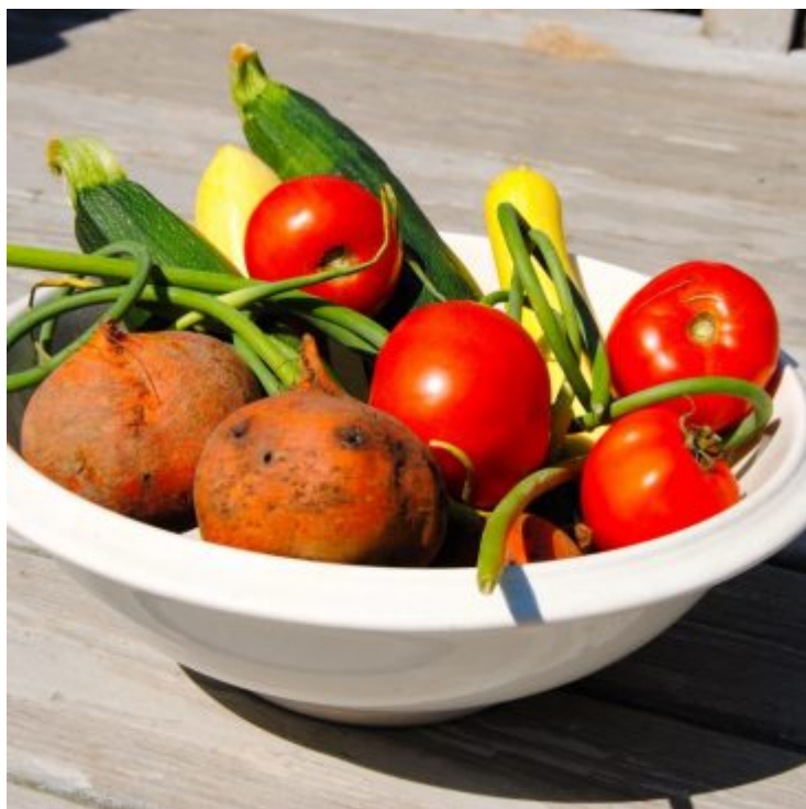
Where To Buy Organic Food in Machias, Maine