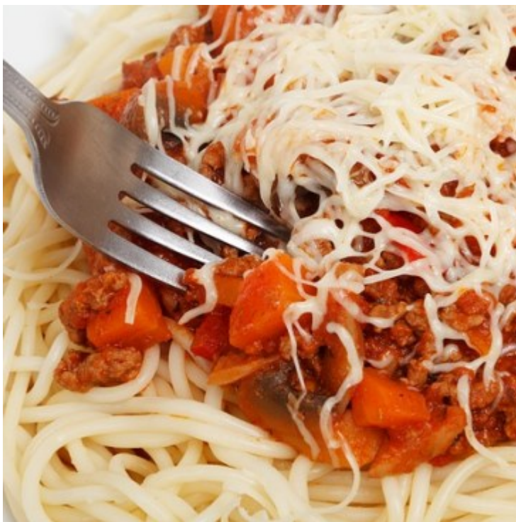
Yancys Pizza - Calais