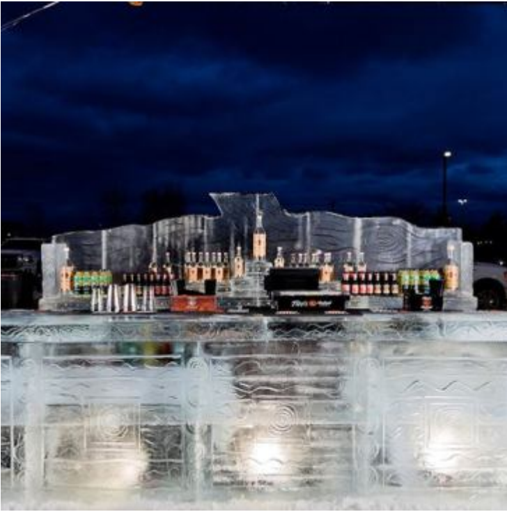
Glacier Ice Bar and Lounge