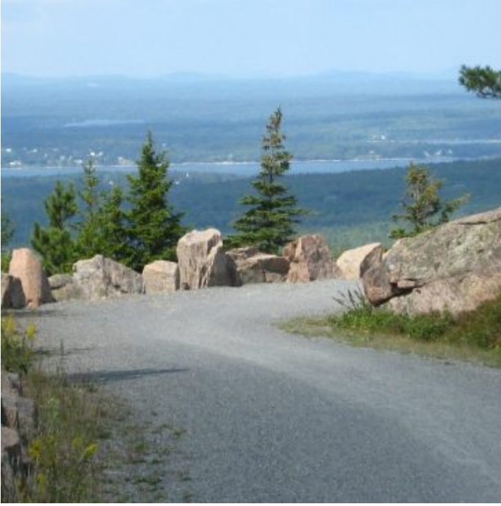
Acadia National Park Tours